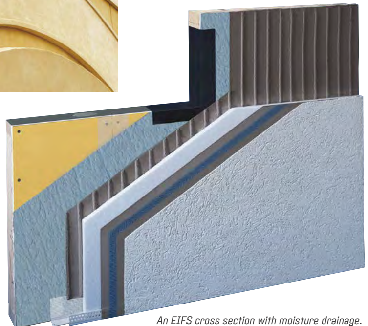
An EIFS cross section with moisture drainage.

EIFS can also be applied to a galvanized steel decking substrate, which is unique