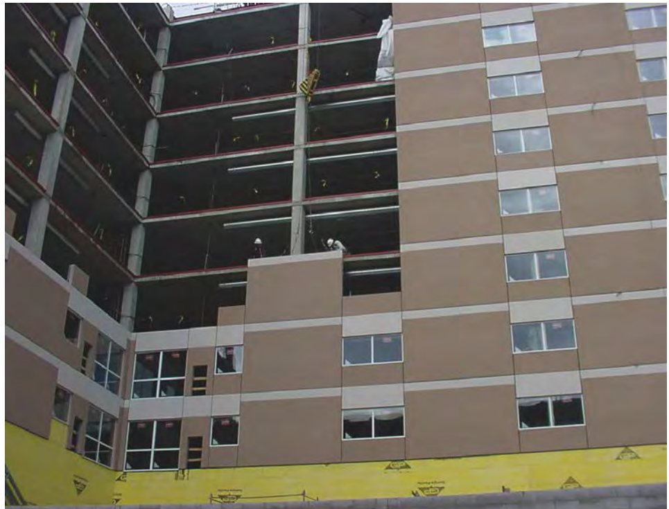
Different-sized panels can be installed, completely finished, to enclose the building quickly and efficiently.

When walls are prefabricated, the fabricator's custom engineer each wall using only